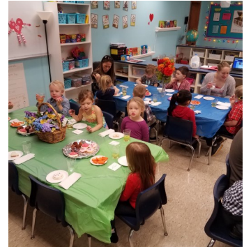
Valentine's Day Tea Party

Our classroom has been working away on being polite and using our manners, performing science experiments, observing what happens when snow melts (we even brought snow into our sensory table), using and identifying rhyming words through nursery rhymes and riddles, and we continued to practice our writing skills. For Valentine's Day we had our annual Valentine's Day Tea Party to practice our manners and being polite. It was a grand success! In addition, we've been working on our letters from A through U. Over the next few weeks we will continue working on our songs for the play, Stone Soup, which we will be performing with the Kindergarten class on April 7th at the St. Paul's Got Talent night.